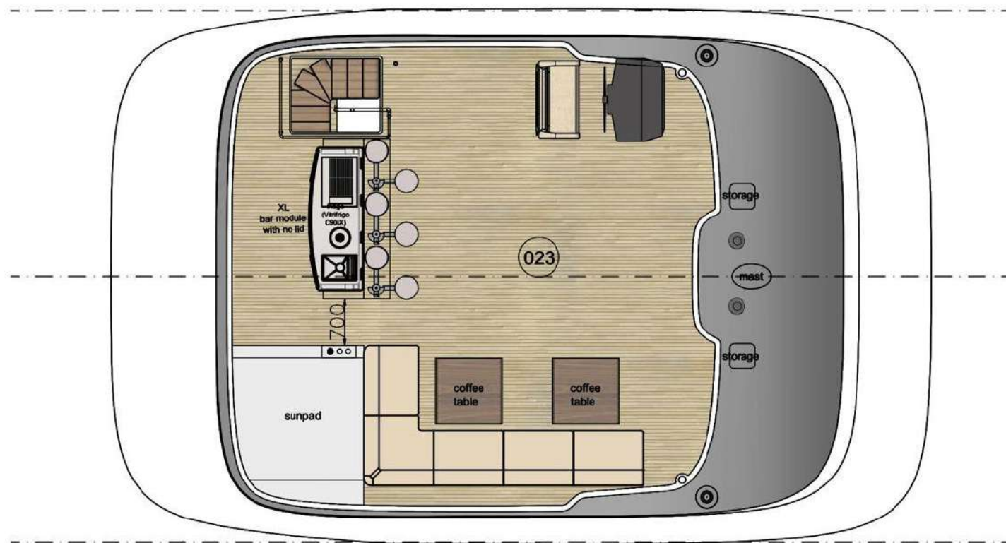
Flybridge arrangement TBD